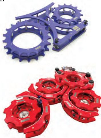
Many color options for easy identification.