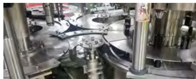
Retrofitting change parts to existing OEM machinery.