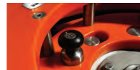
Quick Change Pins.