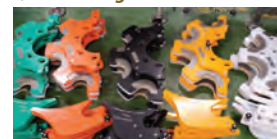
Puzzle Cut Parts, Multiple Colors.