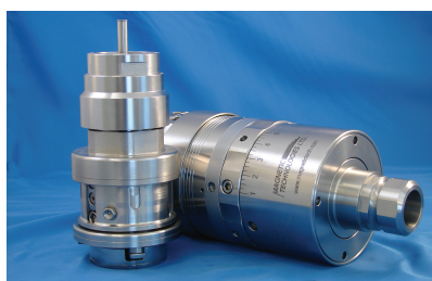
Quick release options available.