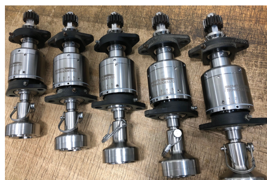
Dairy Headsets for specialty Capper

With a lifetime warranty on sealed magnetic assemblies, Magnetic Technologies offers in-house or in-field refurbishment services to restore products to like-new condition, extending equipment life and reducing replacement costs.