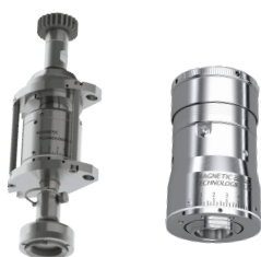
Headsets & Cap Chucks for various applications are available.