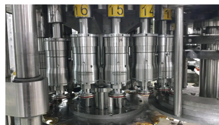
Capper Clutch & Chuck on Kronos 24 Head Capper