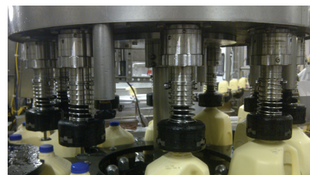
Dairy Headsets on Fogg 700 Series Capper