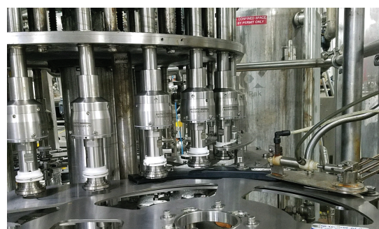
US Bottlers Capper with AROL in-chuck cap knock out