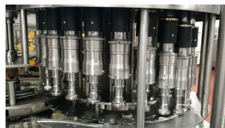
Zalkin Conversion from Gripper Chuck to one piece chuck for Gatorade