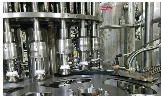
US Bottlers Capper with AROL in-chuck cap knock out